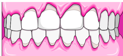
Tobacco users have a greater risk of developing gum disease.

Dental Disease – Smokeless tobacco contains sugar, which can contribute to cavities. It also contains coarse particles that can irritate your gums. Smokeless tobacco can cause stained teeth, persistent bad breath and black hairy tongue.