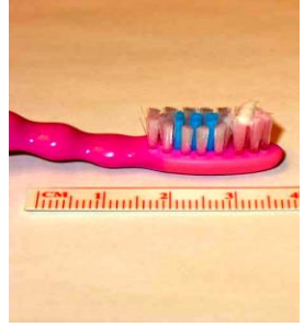
Fluoride toothpaste, the size of a grain of rice

If you answered yes to any of these questions, your child is at risk of early childhood tooth decay. An adult should brush your child's teeth every day, using fluoride toothpaste the size of a grain of rice. Teach your child to spit out the toothpaste, not swallow it.